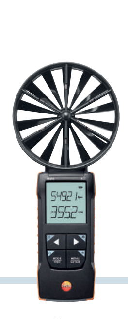
Vane anemometer testo 417 fpm, cfm, °F