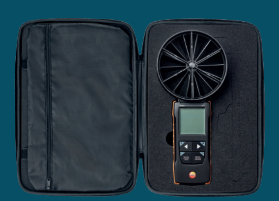
Each instrument comes in a practical, compact, and robust testo Smart Case